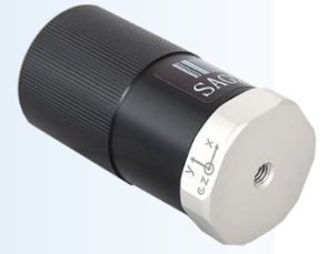
SAG200 wireless IMU