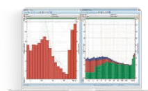
SF 104_30CT License of 1/1 & 1/3 octave