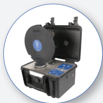
SV 111 Vibration Calibrator