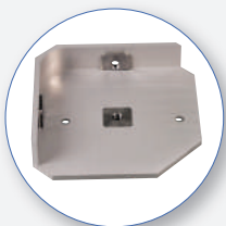
SA 38 Calibration Adapter